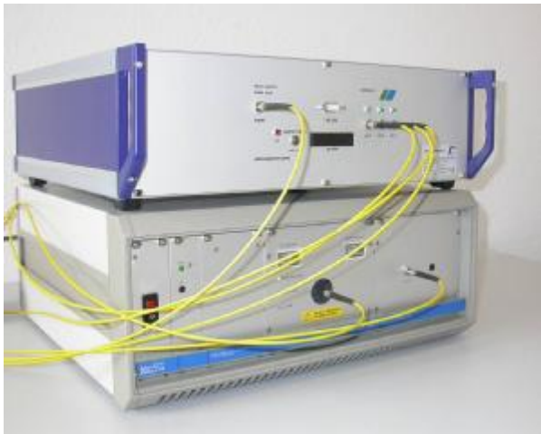
MultiSpec System with Piezo Multiplexer

recommended accessory for the modular MultiSpec instrument family of fast and simultaneous readout spectrometer systems. The standardized SMA connectors at the front side allow the easy use of fiber optics with all types of probes and cells.